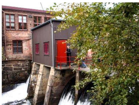
Figure 2: Earlier location

One of our CALM instruments has since 2011 been analysing water sampled from its location, Myraløkka, on the city river Akerselva. The unit was acquired by Oslo Water and Wastewater in collaboration with city district Sagene. The purpose was to establish a bathing spot nearby and therefore there was a need for monitoring the microbial quality. Until last year the CALM has been continuously monitoring the river all year long, except for the winter seasons, generating very useful data. One of the major gains was the high analysis frequency that provided the municipality with a good overview of the annual variations of fecal contamination in that specific zone of the city river. In 2015 Oslo Water and Wastewater decided to move the instrument to the river mouth, e.g. further south, in order to monitor the water that might affect the numerous bathing spots in the Oslofjord. The CALM is therefore now placed in Bjørvika (near the Opera) and happily informing the operators about the water quality in the area at all time.