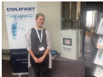
Figure 1: Exhibition in Malmö