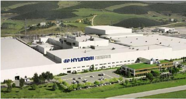
Hyundai Assan car factory in Turkey